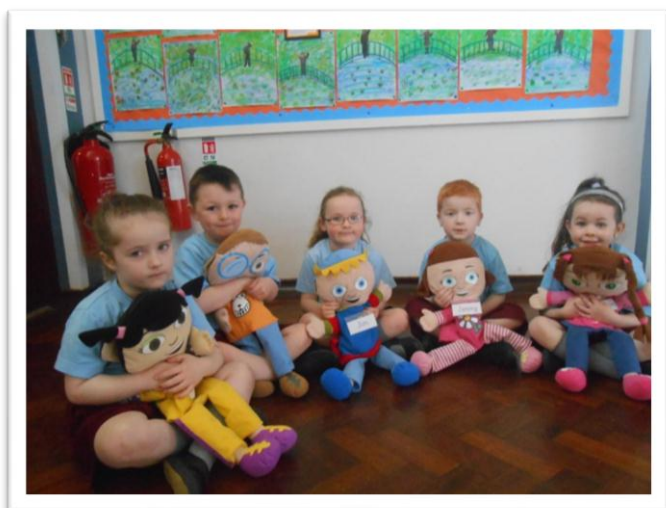
Children using puppets to explore similarities and differences

They have also been on joint educational visits together and shared curriculum focussed activities.