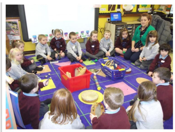
Shared learning experiences with pupils from St Columba's and Killen Primary School