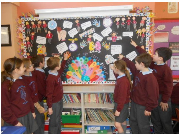
Year 4 and 5 Class Charter