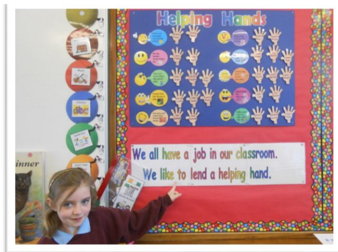
'Helping Hands' in every class- developing mutual respect for each other.