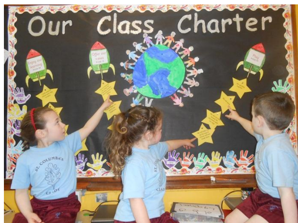
Year 1 Class Charter