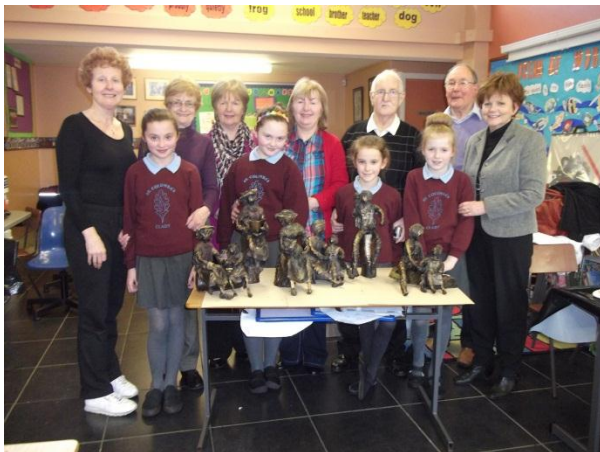
Some of the grandparents and their grandchildren involved in the project